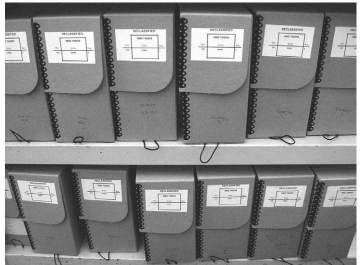
Hollinger archival boxes waiting to be explored at NARA