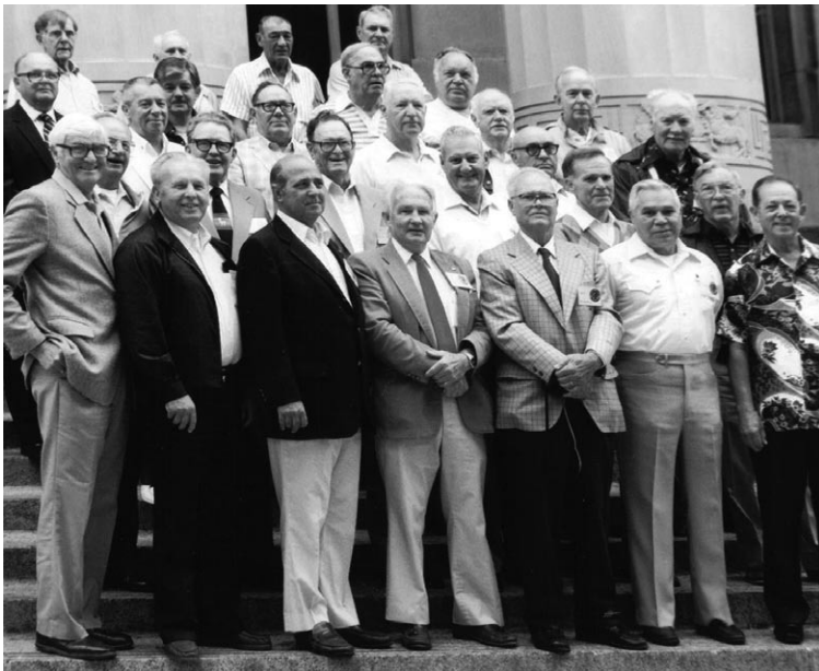
Alamo Scouts 1985 reunion in Ann Arbor, Michigan